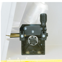
COMPACT 240M - 310